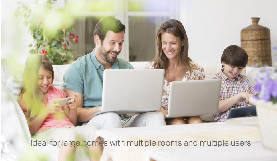
Ideal for large homes with multiple rooms and multiple users