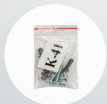
K-41 screw kit