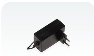
48 V 0.95 A power adapter